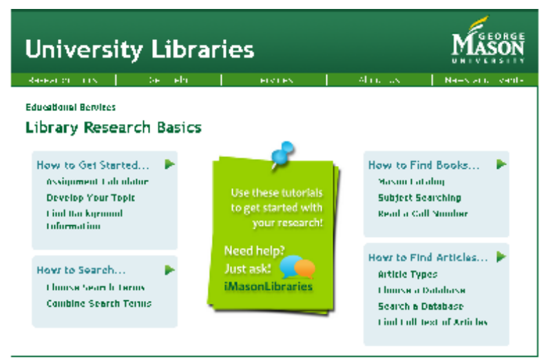
Ask DS | Hours & Directions | Libraries & Z | Library Home Copyright € Goonge Nason Libraries

Are you having trouble getting started with your research or you don't know all that the Mason Libraries can do for you? Start here: http://library.gmu.edu/education/students/research_basics/index.html