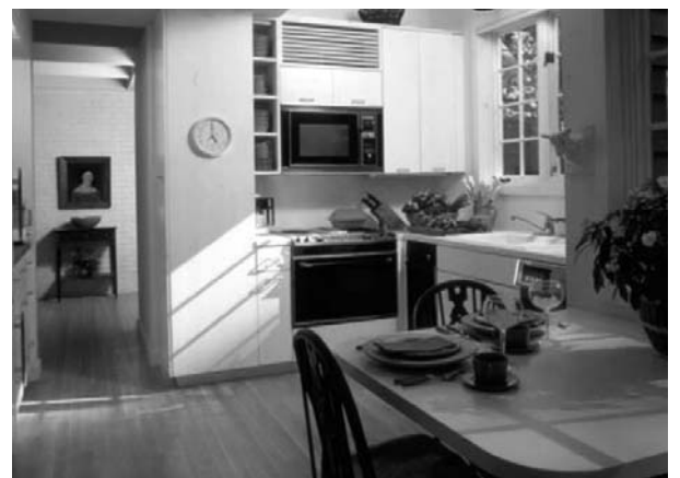
Above: The kitchen from a model apartment in 1970; the wall-to-ceiling flowered wallpaper, dark cabinetry, and avocado-hued appliances reflect decor preferences of the day. In contrast, the kitchen below is from the winner of the “Best Small House” award in 1984. This kitchen followed the movement to create an open feeling with clean lines, white cabinetry, and lots of natural light.

Did You Know: Since FY 1998, annual expenditures for library electronic resources (databases, e-journals and e-books) have more than doubled to $1.9 million.