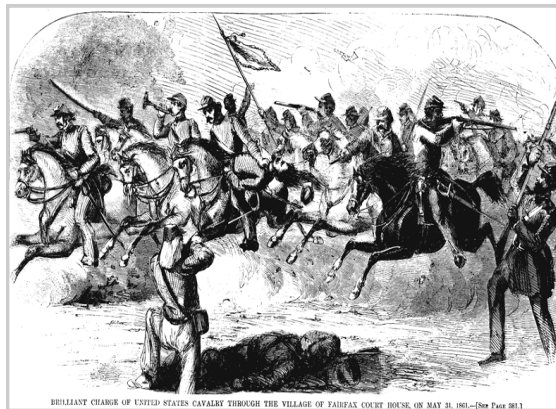
Brilliant Charge of United States Cavalry Through The Village of Fairfax Courthouse, On May 31, 1861. Harper's Weekly, p. 377.