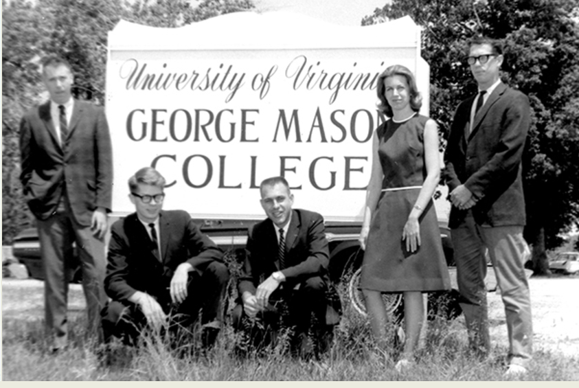
The newly-elected 1964-1965 Student Government officers pose in front of the sign at the entrance to George Mason College on Leesburg Pike, May 2, 1964.