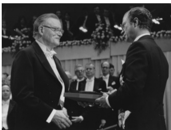
James Buchanan receiving the Nobel Prize in Economics from King Carl XVI Gustaf of Sweden, December 10, 1986.

The James M. Buchanan Papers chronicle the legacy of James M. Buchanan (1919-2013) – economist, Nobel Prize recipient, and National Humanities Medal awardee – whose theories had far-reaching influence on America's national life. In addition to Buchanan's extensive scholarship, the collection contains correspondence, memos, publications, photographs, and other ephemera related to his life and academic career. Spanning 282 linear feet, the collection is the largest and most significant holding in existence of unique, primary source material related to Dr. Buchanan. A completely processed collection will ensure consistent access for all scholars interested in examining Buchanan's influence and enable the Libraries to effectively respond to numerous research inquiries from around the world.