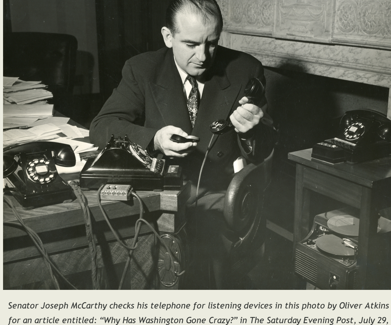
Senator Joseph McCarthy checks his telephone for listening devices in this photo by Oliver Atkins for an article entitled: "Why Has Washington Gone Crazy?" in The Saturday Evening Post, July 29, 1950.