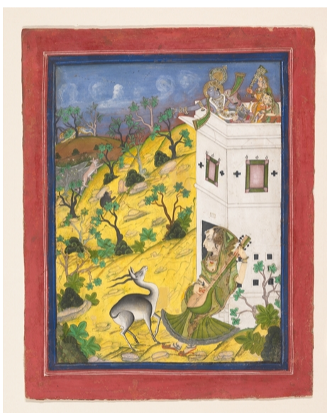
"A Female Musician Charms an Antelope," ca. 1825. Western India, Rajasthan, Kojia. From the collection of the Metropolitan Museum of Art