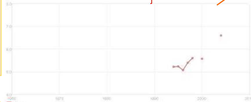
Figure 1 Unemployment

When a Figure is on the same page with body text (and/or section headings), the Figure should be separated from the body text by at least 3 single-spaced blank lines above the Figure itself, and by at least 3 single-spaced blank lines below the Figure's caption. There can be more space, but there cannot be less.